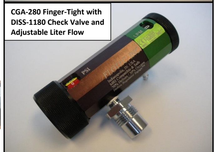
CGA-280 Finger-Tight with DISS-1180 Check Valve and Adjustable Liter Flow