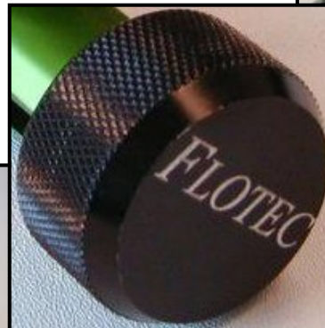
Precision Laser Engraved Identification

Up to 150 LPM Outlet Flow available from a Single 50psi DISS Check-Valve