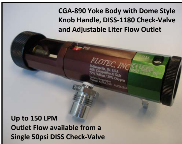
CGA-890 Yoke Body with Dome Style Knob Handle, DISS-1180 Check-Valve and Adjustable Liter Flow Outlet

Up to 150 LPM Outlet Flow available from a Single 50psi DISS Check-Valve