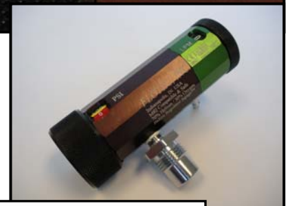
CGA-280 Finger-Tight with DISS-1180 Check Valve and Adjustable Liter Flow Outlet